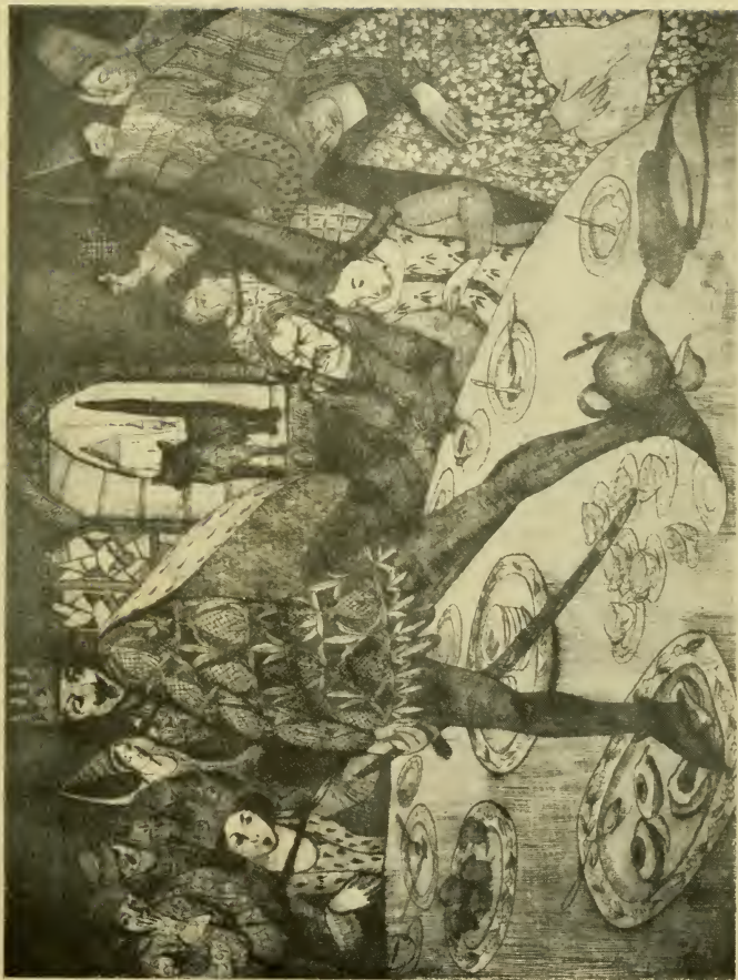
“PLANTING THE OTHER IN THE POACHED EGGS”